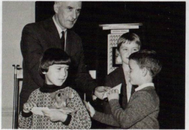
6.3. The Christmas Tree